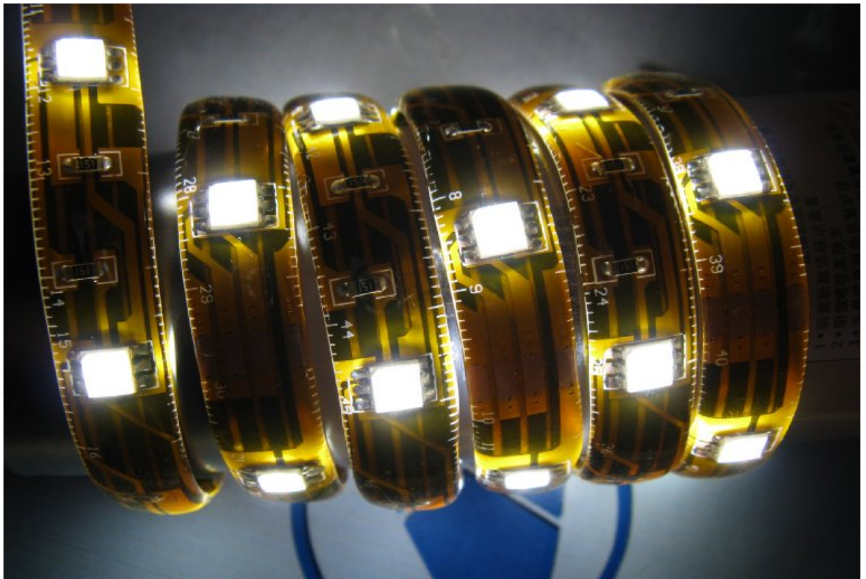
This picture is crystal waterproof (Not-waterproof and tube waterproof available)