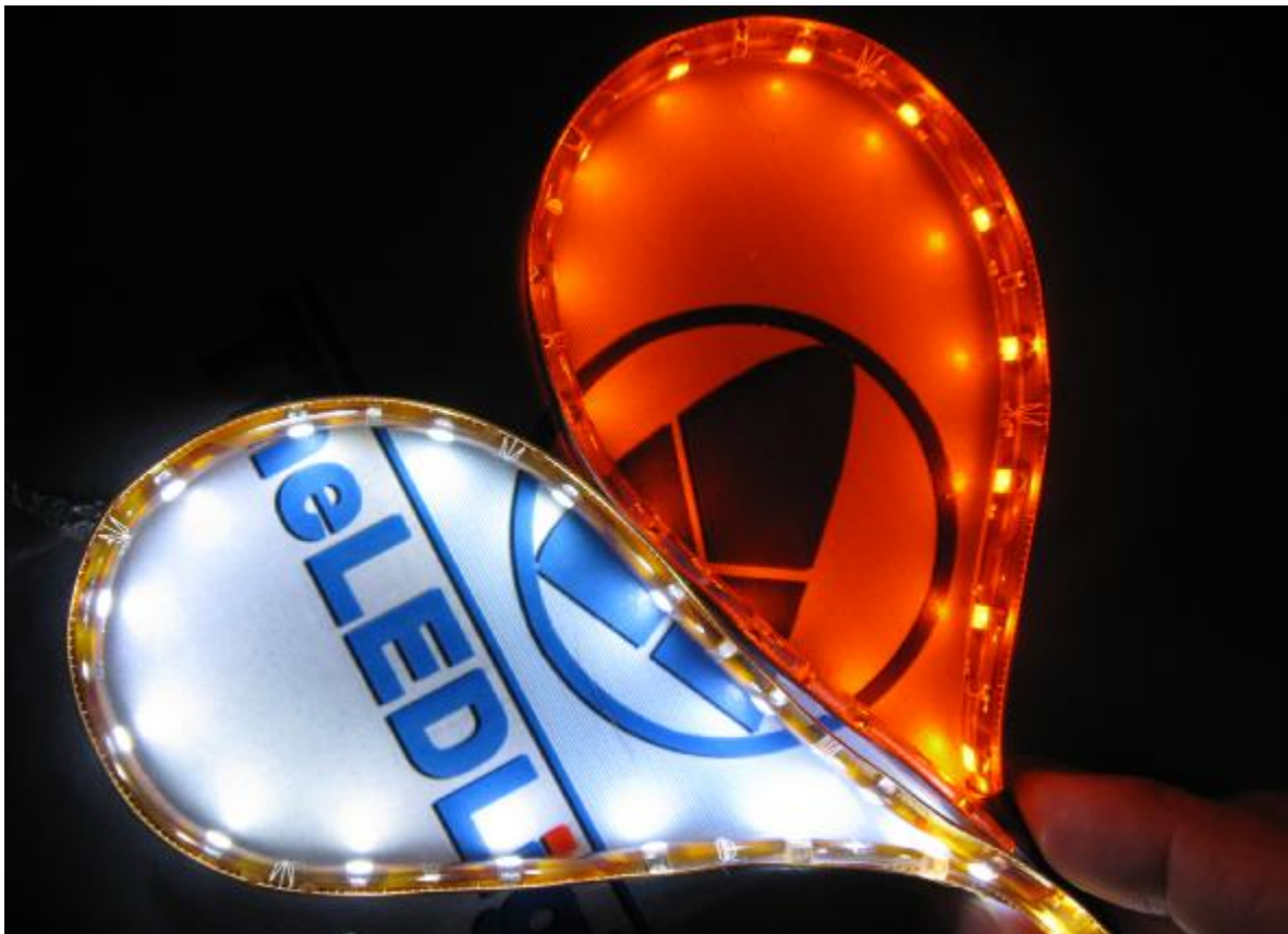
This picture is crystal waterproof (Not-waterproof and tube waterproof available)