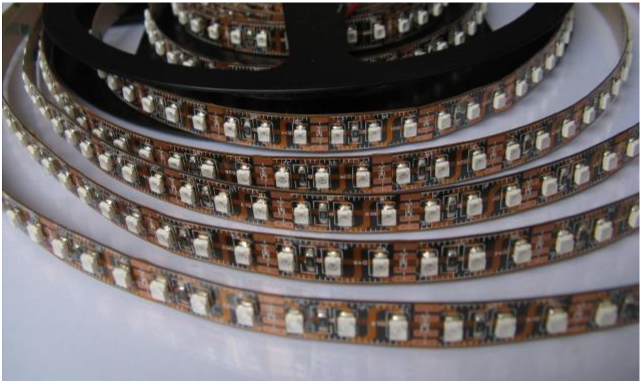
This picture is Not-waterproof (Crystal waterproof and Tube waterproof available)